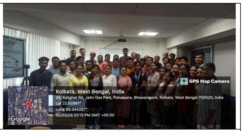
Group photo after the seminar